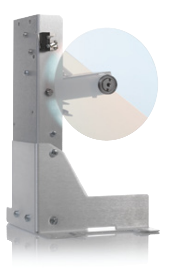
A rotating filter wheel assembly installed in your existing projector inserts between the lamp and picture element for 3D and retracts for 2D.

Dolby 3D projects rapidly alternating full-color images for the left eye and right eye that use slightly offset primary-color frequencies. The audience wears passive glasses with high-fidelity color spectrum filtering lenses that are precisely tuned to specific color bands. Unlike other 3D systems that manipulate the projected image, Dolby 3D technology filters the light prior to the image being formed, which produces an exceptionally crisp, clear image. This approach produces the highest quality 3D images without requiring a special screen or battery-powered glasses.